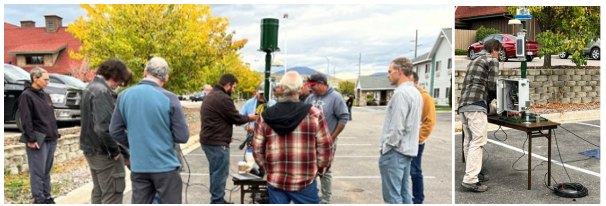
Early Warning System Training attendees gather around a mock Early Warning System site. An Early Warning System Training attendee puts their learning into practice on a mock Early Warning System site.