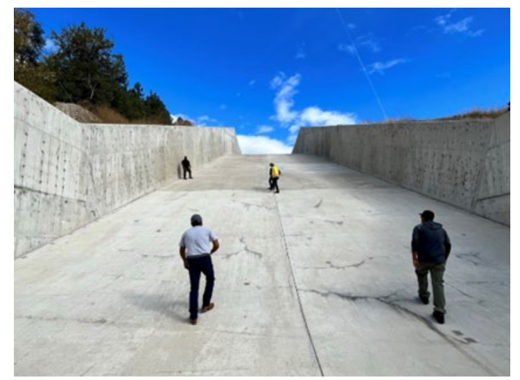
Dam Tender Training attendees perform a mock inspection Crow Dam's concrete spillway on the Flathead Reservation in Montana.

The next similar training will be conducted in Gallup, NM April 2-4, 2024. Dam safety staff can contact their Regional SOD Officer if they are interested in attending.