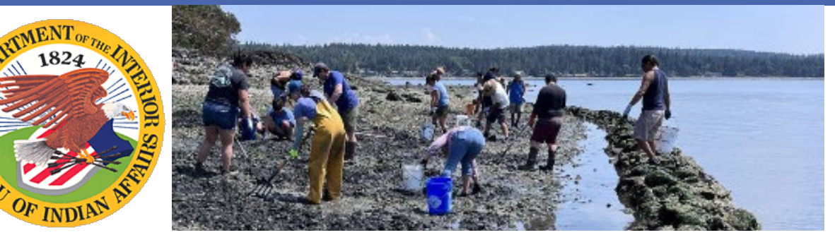
Swinomish Indian Tribal Community members and staff tend the clam garden.