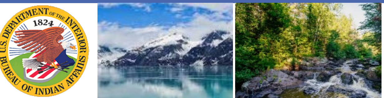
Youth Camps planned for Nanwalek, Alaska and Bad River, Wisconsin