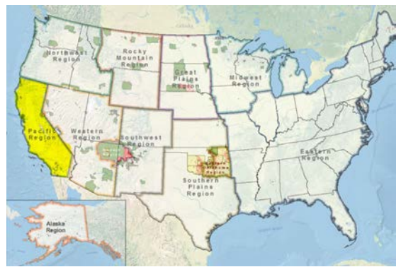
Pacific Region service area encompasses Tribes throughout the State of California