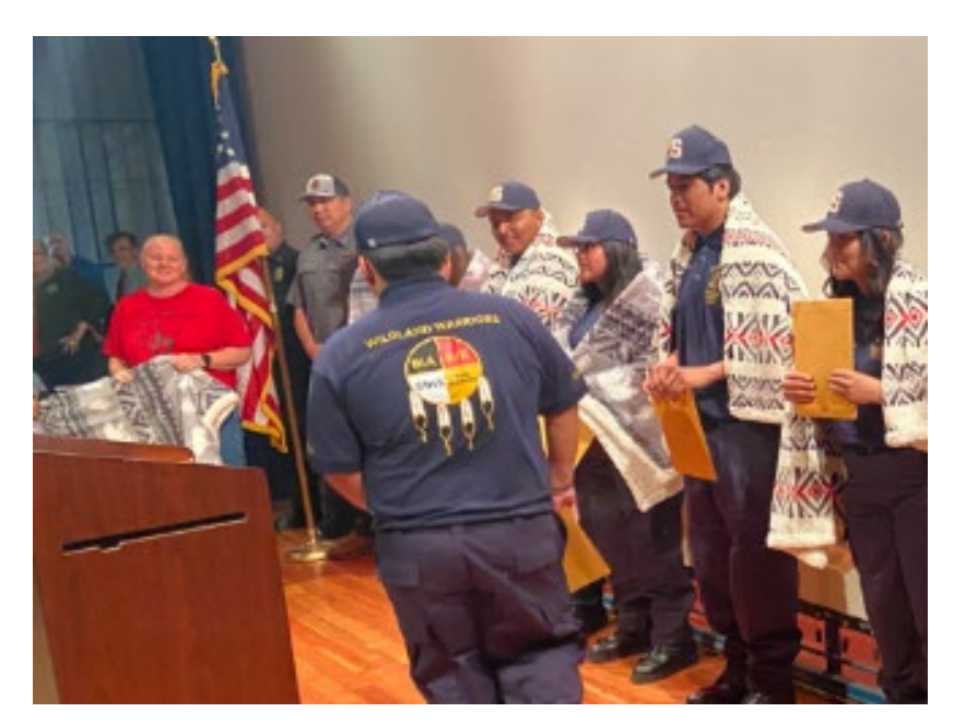
First Basic Wildland Fire Academy Graduation

We are also expanding the BIA-Fire curriculum to introduce other components related to fire (e.g. operations, fuels, prevention, leadership, etc.). The students have shown commitment and want to learn more about choosing a fire profession as a career, so the possibilities of this program are unlimited.