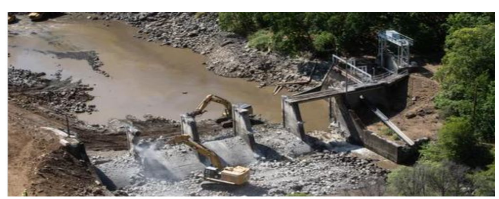
Down comes Copco No. 2. Destruction of Hydroelectric Facility on the Klamath River is underway.

Tribal advocacy created the opportunity for the collective effort to remove the Klamath dams. tribal leadership and perspective have profoundly shaped the course of events on the Klamath over the past two decades. A series of court cases and a 1993 legal opinion from the Department of the Interior affirmed Yurok and Hoopa fishing rights. Tribes have legal priority, both upriver and downriver. Removing the dams is expected to reopen more than 400 miles of habitat for steelhead and other threatened and iconic fish.