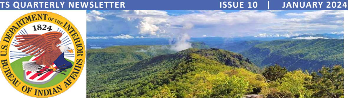
TRUST LAND RESOURCES • RESOURCES STEWARDSHIP • RESULTS THAT MATTER