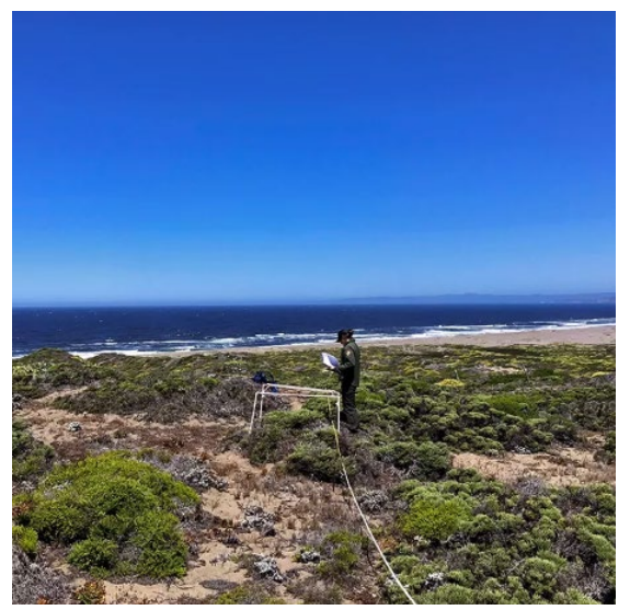
Source: National Park Service technician uses transect to conduct measurements of a coastal scrub plan

A transect is a straight line that cuts through a natural landscape so that standardized observations and measurements can be made. Transects are the building blocks of field observations. They are used to help measure, make observations, and record data across multiple monitoring plots. It allows the technician to track the complexity of the environment over time and compare it to others.