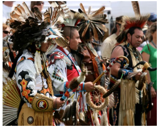
California tribal dancers.