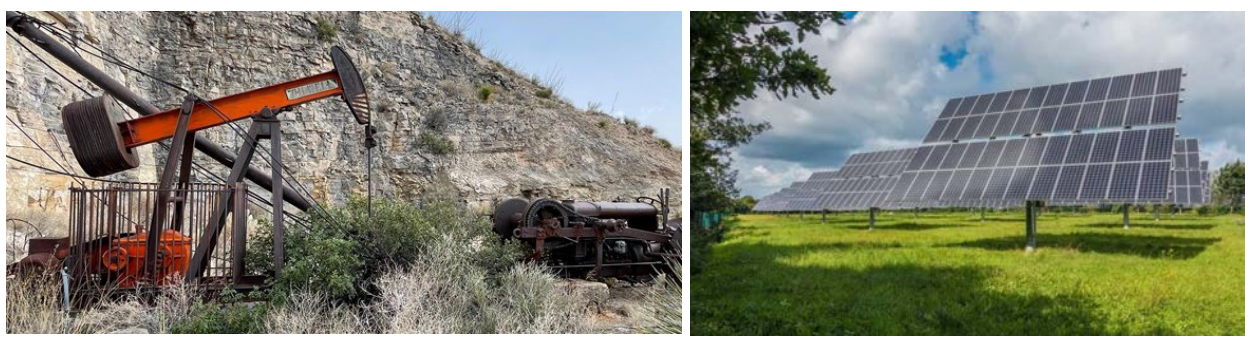
Abandoned well and solar panels