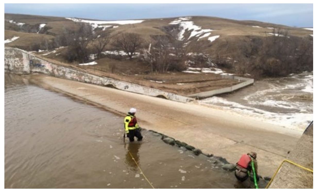
Dam Safety staff sandbagging the Oglala Dam spillway during the 2019 flooding.

These investments are necessary to protect downstream communities and improve overall performance of the dams. The reservoir formed by Oglala Dam was drained in 2019 to protect communities downstream following flood damage that compromised the spillway and outlet works. The project will restore an important local water supply for the Pine Ridge community. The total cost of the Oglala Dam project is $40 million.