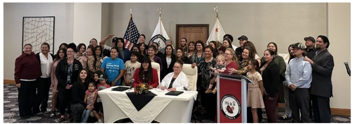
Fee to Trust Signing Ceremony – Picayune Rancheria

Whether we are taking one acre or a hundred acres of land into trust, restoring lands to the Tribes we serve is crucial in fulfilling our mission and trust commitments to our Tribes and Native American Communities we serve.