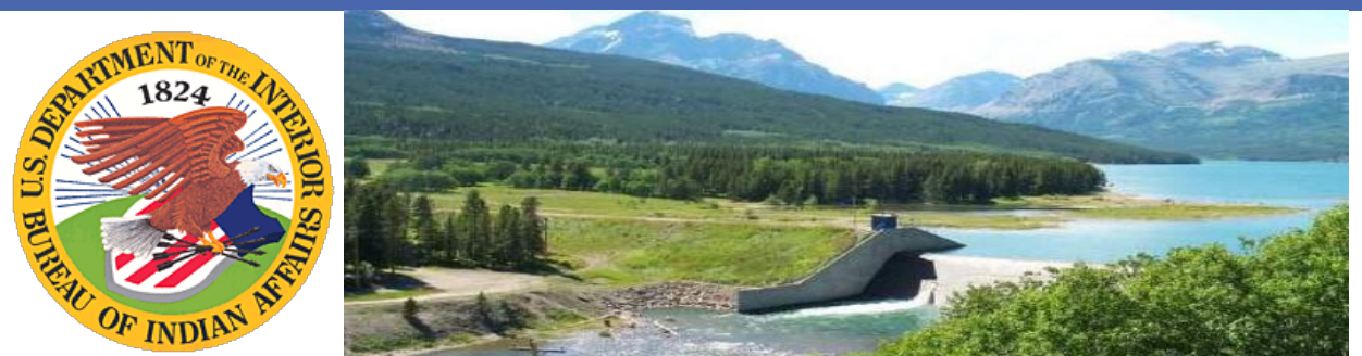
Two Medicine Dam, Blackfeet Reservation, Montana