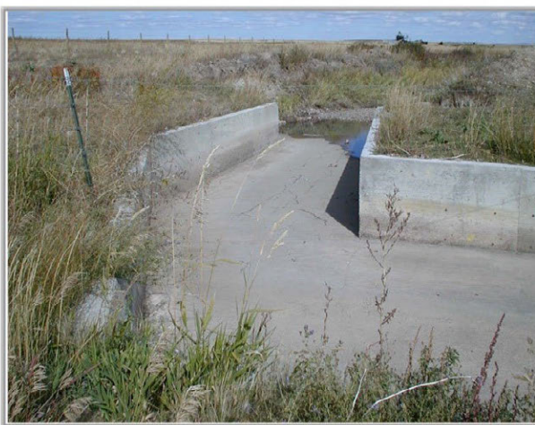
FLUME - OUT