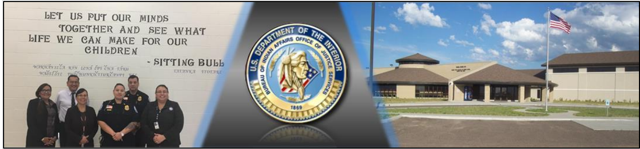
A group of officers at the Standing Rock Youth Detention / Youth Services Center with juvenile educators, juvenile officers and HQ program officers (left), IA Office of Justice Services seal (center), and Wanbli Wiconi Tipi - Rosebud Youth Wellness and Renewal Center – Juvenile Detention Center with US flag in the foreground (right).

IA is responsible for providing Detention/Corrections services or funding to approximately 232 Tribes. Of those, 48 Tribes have compacted or contracted detention center funding and BIA directly operates detention centers that serve roughly 21 Tribes. The detention needs of the remaining 163 Tribes are handled via “direct service”, whereby IA funds commercial contracts with local county or Tribal facilities to house Tribal inmates. The FY 2025 request includes additional funding to support the operational needs of Indian Country detention and corrections programs. The additional resources will help cover growing personnel, equipment, and technology costs necessary to support safe and secure confinement of offenders.