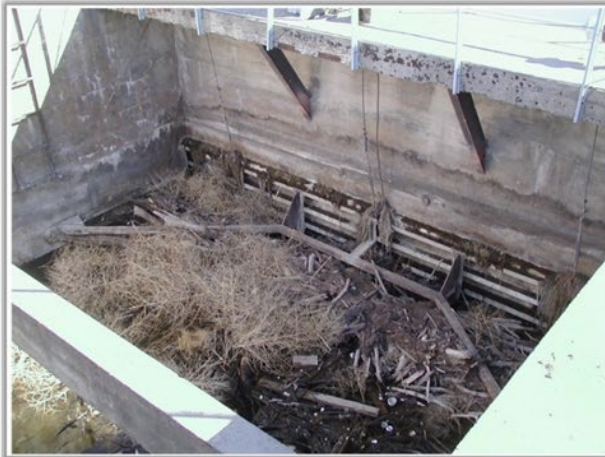
Debris and damage behind headworks' radial gate