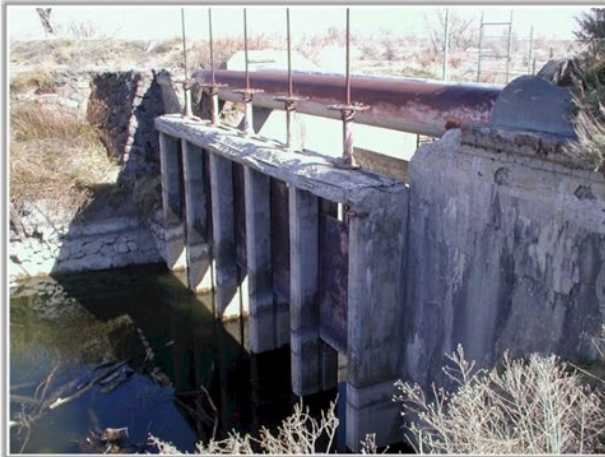
Concrete damage on out of headworks (back side of gates)