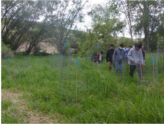
Nez Perce youth planting willow stands to recover beaver populations.

wildlife resources while also collaborating with adjoining land managers to accomplish landscape-level management needs.