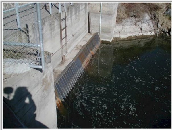
Trash rack before headworks