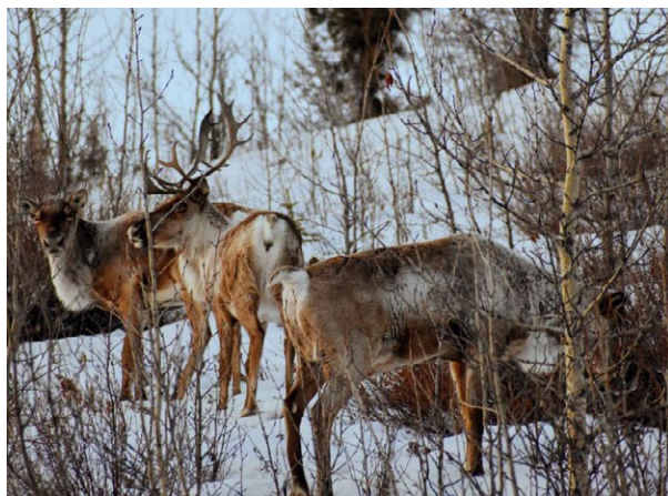
Nelchina Caribou as they migrate through the Ahtna Traditional Territory

Alaska Native Subsistence Program - The Alaska Subsistence program funding supports subsistence hunting, fishing, and gathering plus use of all wild resources (birds, mammals, fish, and plants) from the tundra, forests, streams, rivers, lakes, seashore, and ocean environments of Alaska. Subsistence practices are closely bound to the lifestyle of Alaska Natives, who have long relied upon the land to not only provide physical sustenance, but also to continue rich and diverse cultural traditions. Funds will support and expand projects in targeted areas across Alaska that involve Tribal cooperative management of fish and wildlife, to improve Tribal access to subsistence resources, and to also support IA's role in the Federal Subsistence Management Program in implementing Title VIII of the Alaska National Interest Land Conservation Act (ANILCA).