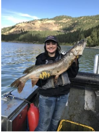
Lake Roosevelt Northern Pike Suppression and Monitoring Project

Lake Roosevelt - Provides funds for the Confederated Tribes of the Colville Reservation and the Spokane Tribe of the Spokane Reservation as part of an MOU to conduct law enforcement and safety patrols along over 150 miles of the shoreline of Lake Roosevelt, in north central Washington State.