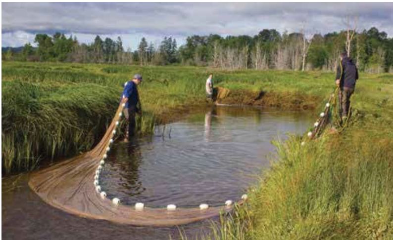
The Skokomish Tribe's fisheries staff seines the restored estuary to determine which fish species are using the side channel while migrating to and from Hood Canal.

NWIFC Wildlife Program - The NWIFC wildlife program provides coordination and support services to its member Tribes on a variety of wildlife management issues and projects.