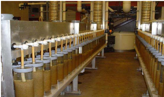
Lac du Flambeau Walleye hatching jars at the William J. Poupart, Sr. Tribal Fish Hatchery.

Tribal hatcheries continue to play a vital role in supporting Tribal fisheries. Hatchery-produced salmon now contribute the majority of salmon harvested in all Washington fisheries, both treaty and non-treaty. Therefore, Tribal hatcheries are a major contributor to the economic value of Washington's commercial and recreational salmon fisheries. In several cases, the Tribal hatcheries are providing the only harvestable salmon and steelhead for the Tribe. For the Boldt Case area Tribes, these hatcheries are an essential component of the Tribes' economies. The production from Tribal hatcheries is also harvested by non-Tribal commercial and recreational fishermen. In the Great Lakes Region and throughout the rest of the country, recreational opportunities created by the stocking of trout, walleye, and other species provide for Tribal subsistence while also attracting sport fishermen to Indian reservations and assisting in the development of reservation economies.