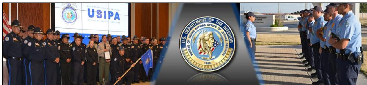
Officers in a ceremony at the Indian Police Academy in Artesia, NM (left), IA Office of Justice Services seal (center), and officers standing at attention outside at the Indian Police Academy (right).

The Indian Police Academy (IPA) is located at the Department of Homeland Security Federal Law Enforcement Training Center at Artesia, New Mexico and provides basic police, criminal investigation, telecommunications, and detention training programs at no cost to Tribal or Federal personnel serving the critical public safety needs of Indian Country. The Academy offers a wide range of collaborative training opportunities at the Federal Law Enforcement Training Center (FLETC)- Artesia (NM) and Glynco (GA) Centers for instructor-led and e-FLETC courses and on-site training in specialized courses.