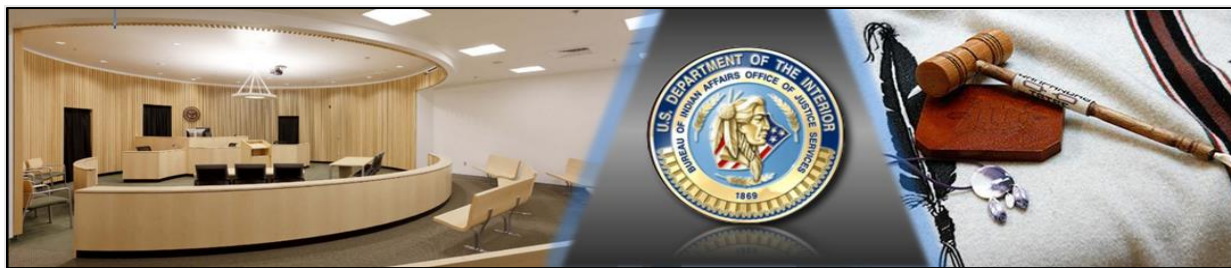
Tribal courtroom with wooden furniture (left), IA Office of Justice Services seal (center) and a wooden gavel set with Native design beside a decorative feather (right).

The Office of Tribal Justice Support (TJS) is a vital contributor to the BIA initiative to target significant and rising criminal justice issues impacting Native American communities, particularly Native women. The 2013 and 2022 VAWA reauthorization included special domestic violence criminal jurisdiction provisions affecting Indian populations on reservations which has had a significant impact on Tribal justice systems. To ensure compliance with provisions contained in VAWA, IA conducts training for direct service program staff in the areas of law enforcement, social services, victim services, and courts, as well as provides additional technical assistance and training to Tribes operating these programs under Pub.L. 93-638 contracts and compacts, and assists Tribes in updating their codes to reflect provisions in the VAWA Reauthorization as they “opt in.”