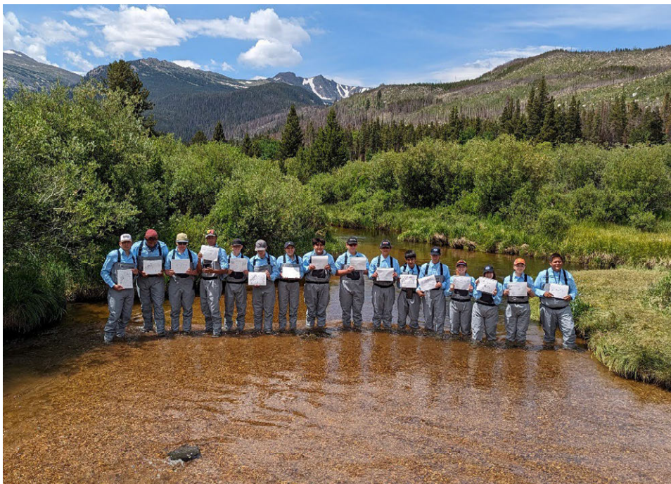
Group photo of students that attended the NAFWS 2023 National Summer Youth Practicum at Colorado State University's Mountain Campus in Bellevue, Colorado.

Native American Fish & Wildlife Society - For more than 35 years, the Native American Fish & Wildlife Society (NAFWS), a non-profit, has addressed needs of its 227 member Tribes directly, through conferences, training, and youth education; and indirectly through ongoing support of, and providing venues for government consultations, discussions, and by participating with innovative projects and initiatives in Indian Country. Through its years of assisting Tribal efforts to build capacity and services, the NAFWS enriches Tribes through its mission: assisting Native American and Alaska Native Tribes with conserving, protecting, and enhancing their fish, wildlife, habitat, and cultural resources.