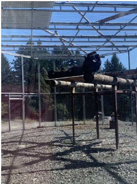
Photos above show the Yurok Condor flight pen and observation blind where the Tribe monitors, studies, and cares for Prey-go-neesh until they can be released into Ancestral Territory. Once released, the Tribe continues to monitor the flock, and the health of individual birds, using carrion to lure them to an area where they can be safely observed.