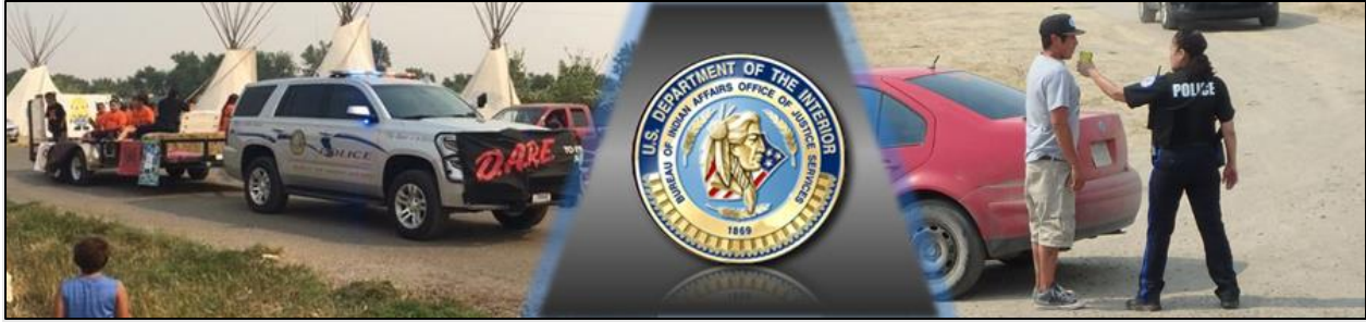
Police vehicle participates in a procession (left), IA Office of Justice Services seal (center), and an officer and civilian in a traffic stop (right).

The program supports 198 total law enforcement offices, which include 25 full-function agencies operated directly by OJS, 164 agencies that are contracted or compacted for operation by Tribes, and 8 OJS sub-agencies that do not have defined service populations. Approximately 66 percent of the funds under Criminal Investigations and Police Services are expended by Tribes under Pub.L. 93-638 contracts and self-governance compacts. Unlike other IA programs, Criminal Investigations & Police Services is a mobile program where personnel respond to immediate life/safety protection needs on a 24/7 basis 365 days/year for over 200 Tribes in 10 IA regions that include over 1.6 million people living on Indian land across the United States.