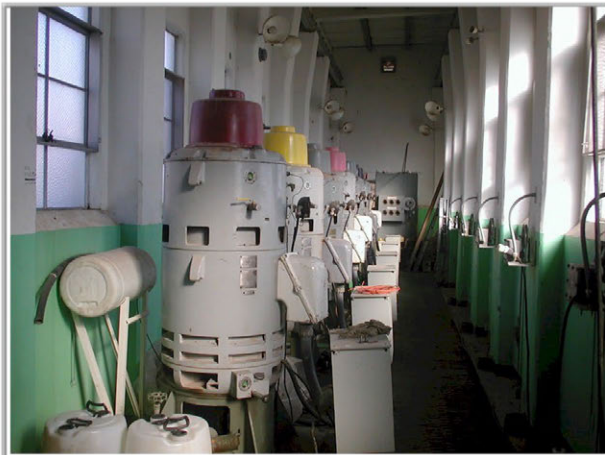
PUMPS INSIDE BANNOCK PUMPING PLANT

Current: $ 0 Projected: $ 0 Net Change: +/- $ 0