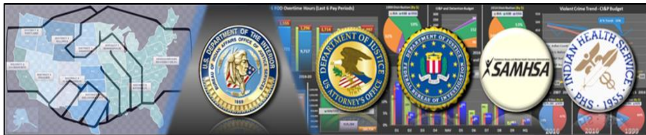
Map design with OJS regions (left), IA Office of Justice Services seal (center), and seals of the US Attorney's Office, Federal Bureau of Investigation, Substance Abuse and Mental Health Services Administration, and Indian Health Service (right).

BIA is the Federal entity most directly responsible for maintaining law and order throughout Indian Country. This funding supports the Office of Justice Services’ national leadership team and a number of administrative or support services to manage the activity effectively for Tribes. The team collaborates with other Federal partners and develops and disseminates standards, policies, and procedures for IA implementation of the law enforcement, corrections, emergency management, land mobile radio, Tribal court, and justice training programs.