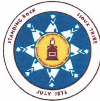
Standing Rock Sioux Tribe of North & South Dakota