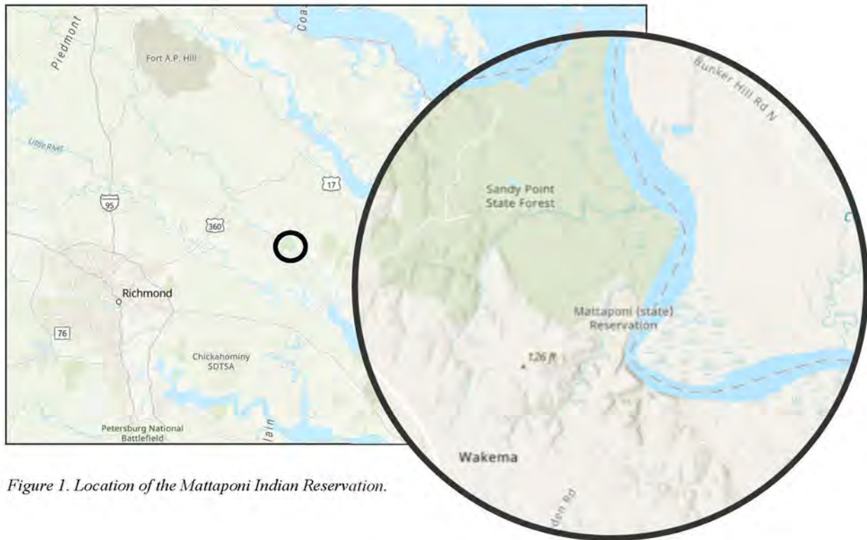
Figure 1. Location of the Mattaponi Indian Reservation.

The Reservation is located on the Mattaponi River, adjacent to the Sandy Point State Forest, approximately 40 miles from the state capital (Richmond, Virginia), and 120 miles from Washington, D.C.