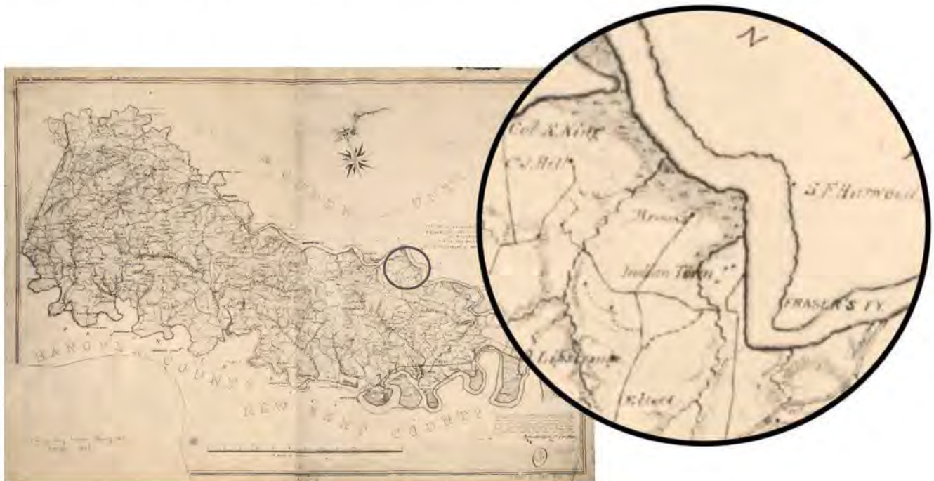
Figure 4. Confederate Engineer Bureau Map of King William County, Blackford et al. 1865.

While maps reproduced above demonstrate the presence of colonial and independence era Indian settlements in the approximate location of the present-day reservation, maps produced in the 1800s, particularly those produced at the time of the Civil War, detail the Mattaponi Indian Reservation's location prior to 1900. These maps consistently locate the Reservation above Frazer's Ferry (now known as Wakema), often listing it as "Indian Town." 133