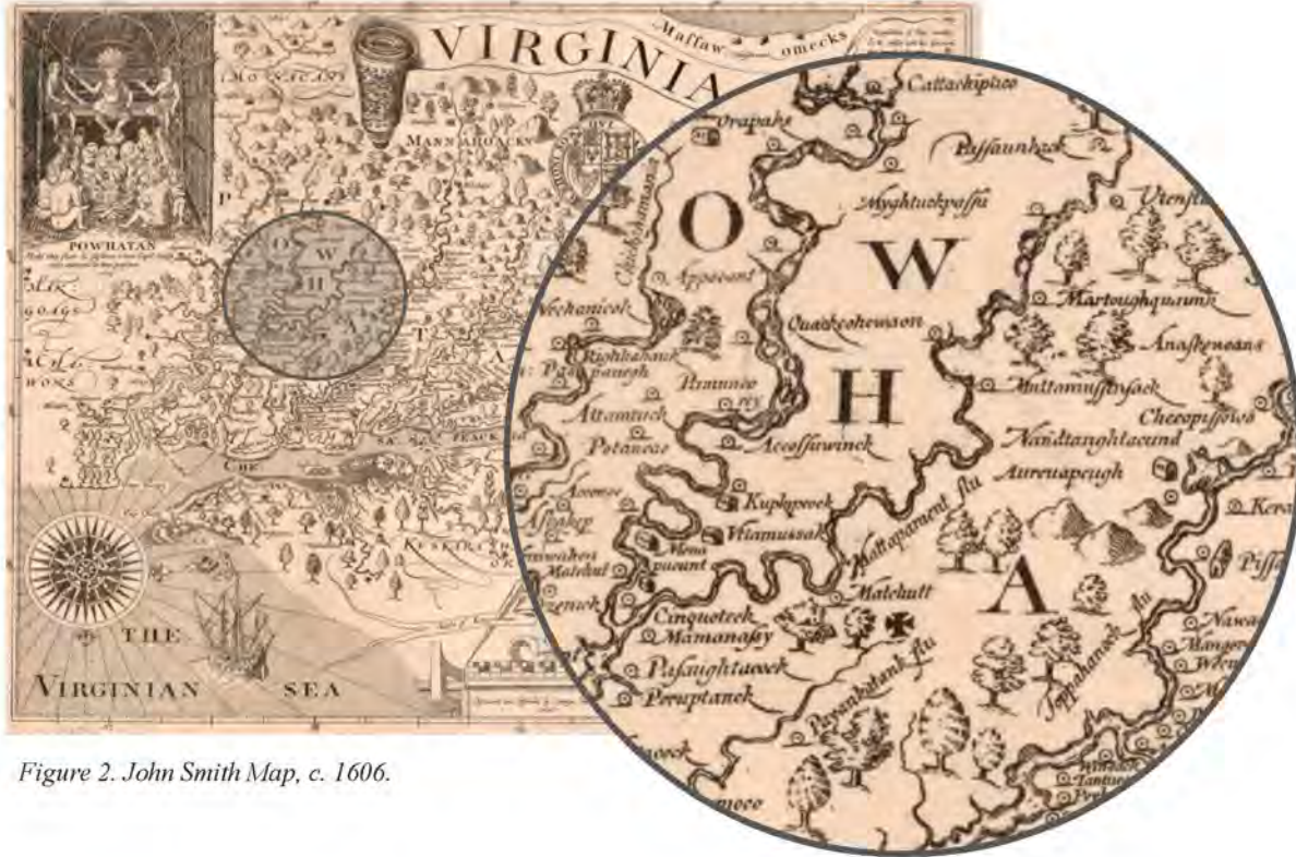
Figure 2. John Smith Map, c. 1606.

Smith's map identifies a number of Indian villages situated on either side of the "Mattapament flu" and locates the village of Mattamussensack on the King and Queen County side of the river 11 near the location of the contemporary Mattaponi Indian Reservation, which sits on the southern bank. 12