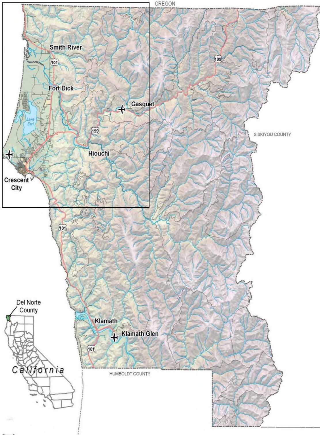
Map of Del Norte County, including Del Norte Athabaskan Locations 2