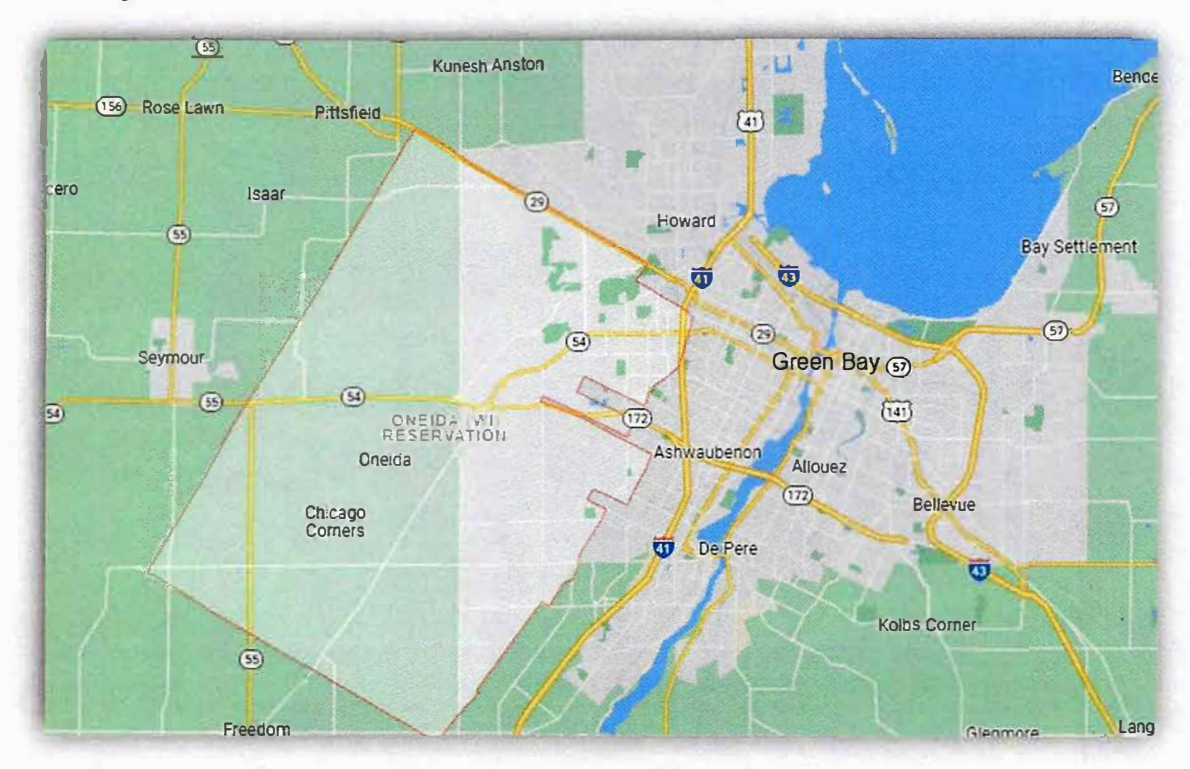
Figure 1 Map of Oneida Reservation Boundaries<sup>17</sup>