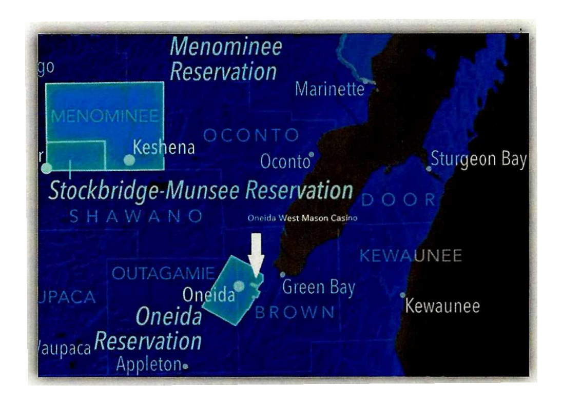
Figure 2 Approximate Location of Oneida West Mason Casino on Oneida Reservation

As explained above the Oneida Reservation in Wisconsin was established by treaty in 1838 and remains intact. Therefore, I conclude the Nation had a reservation on October 17, 1988. The West Mason Site is located within the boundaries of the Oneida Reservation in Wisconsin. The Map at Figure 2 below, shows the approximate location of the Site within the Oneida Reservation.