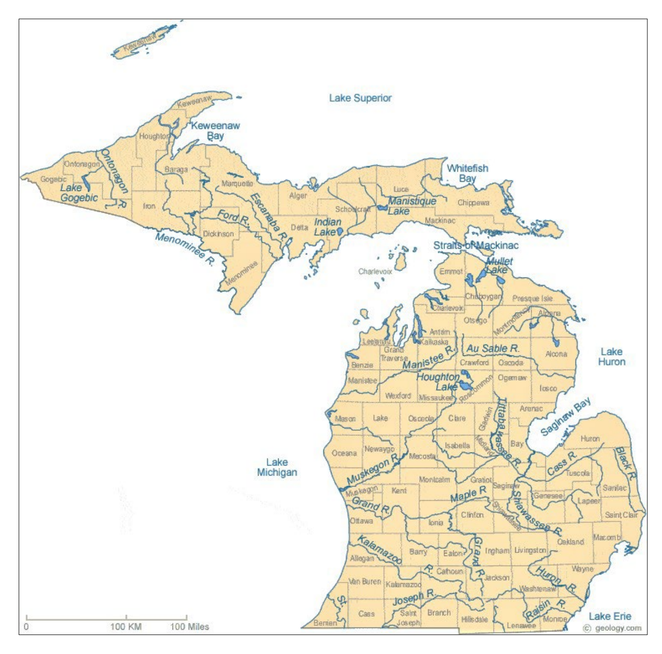
Map 3. Contemporary map of Michigan counties and primary rivers.<sup>4</sup>