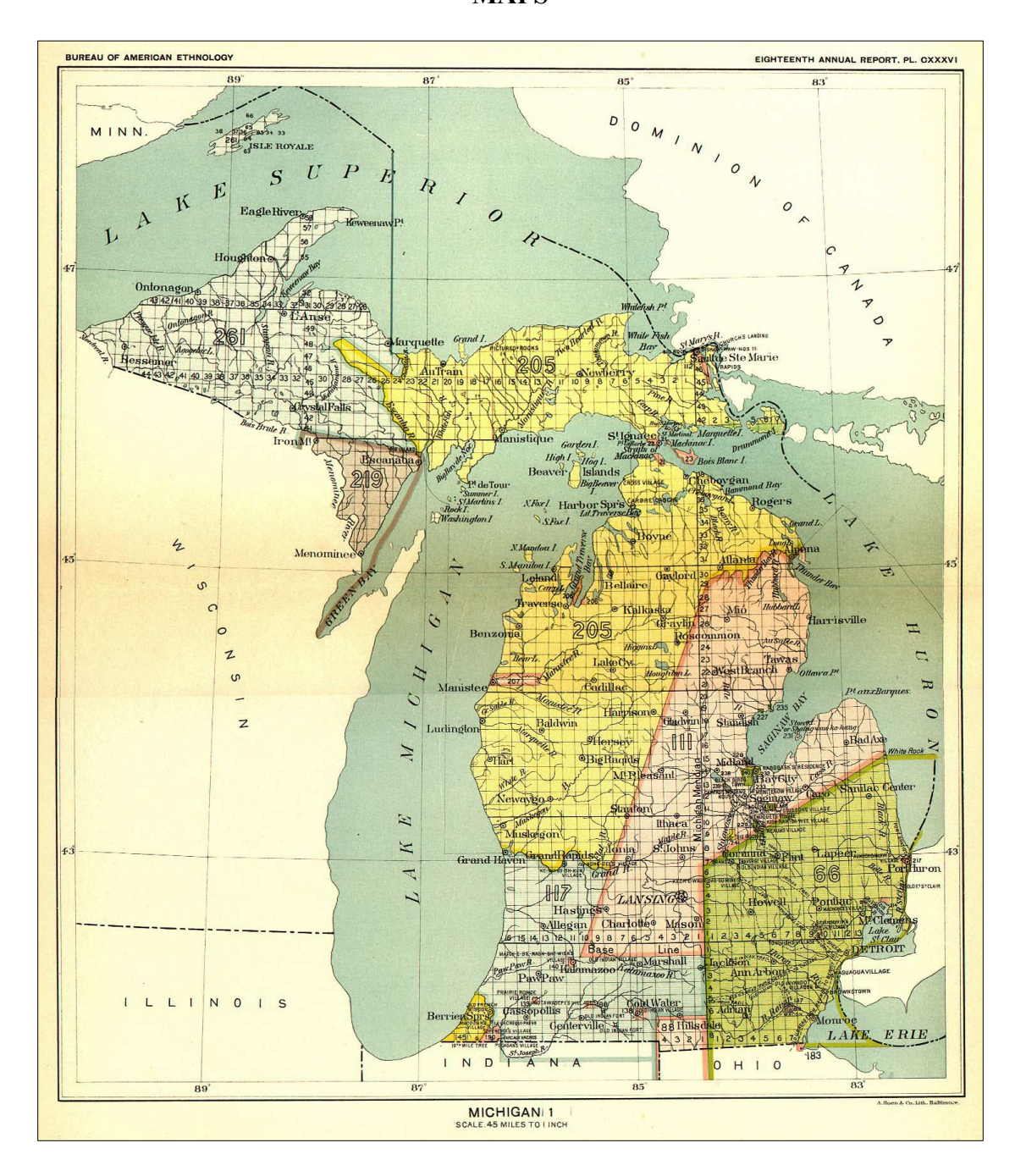
Map 1. U.S. Treaty Land Cessions. Section 205 refers to lands ceded in the 1836 Treaty of Washington by the "Ottawa and Chippewa nations of Indians."<sup>2</sup>