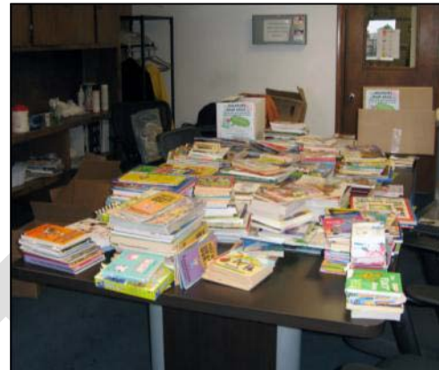
Six boxes of books were collected from the interagency community at the National Interagency Fire Center.

The organizing group and the NIFC NPS Employees' Association were overwhelmed with the response from the interagency community in support of the children of the Wind River Reservation. Over 7500 books have been contributed to the Operation Alliance Book Drive so far and the National Interagency Fire Center is proud to have played a supporting role in its success.