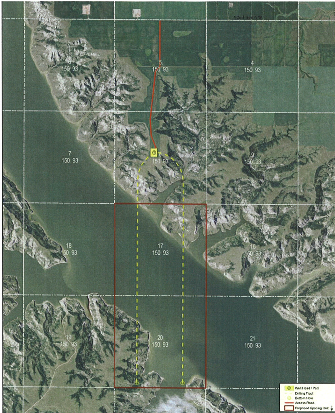
Figure 2, Site Overview Map