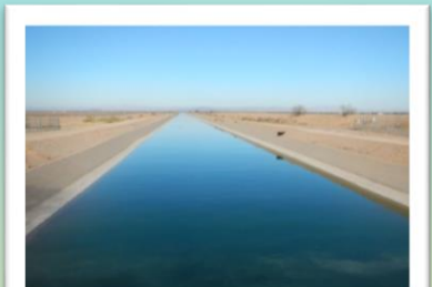
Canal at Gila River Indian Reservation