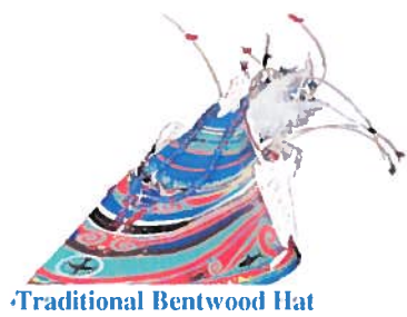
Traditional Bentwood Hat