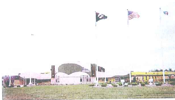
Fond du Lac Ojibwe School, Minnesota