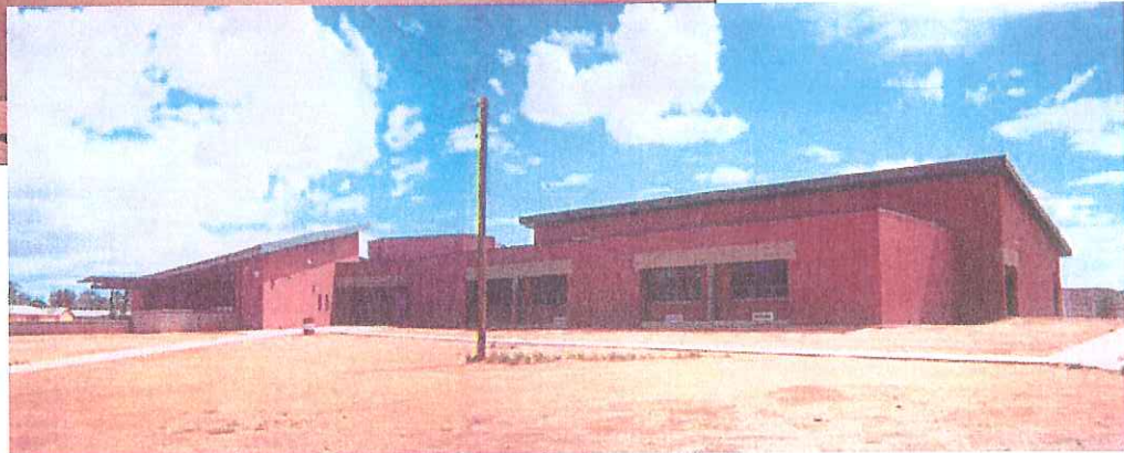
Many Farms High School Arizona

Improvements Needed To Ensure Safety And Program Performance