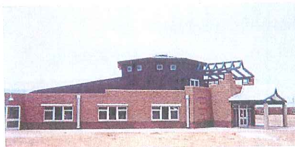
Seba Dalkai Boarding School, Arizona