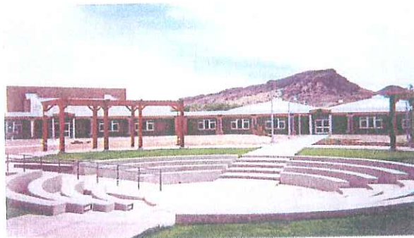
Shiprock Alternative School, New Mexico

Improvements include contracting with private firms to conduct evaluations of grantee management systems before awarding grants and limiting advance payments based on the grantee's risk rating.