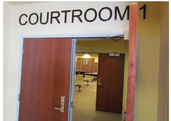
One of three courtrooms in the Courts building.

The Eastern Navajo Diné Justice Center in New Mexico consists of five key buildings, each with a different function: