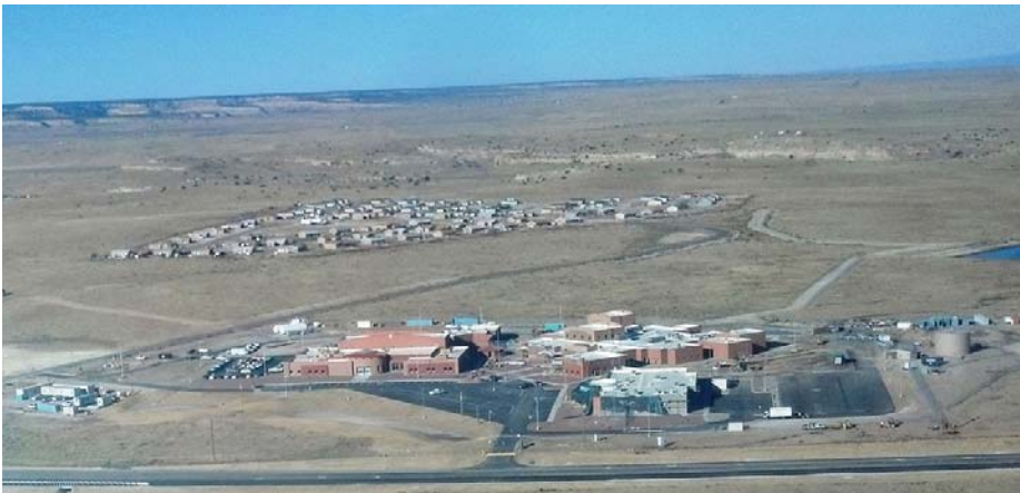
An aerial view of the New Mexico complex under construction.