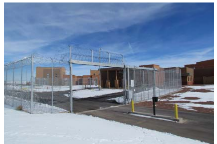
This Sally Port leads to Juvenile Detention.

Restrooms and other service areas are ADA compliant; some are detention grade while others are for public use. The Justice Complex is designed to conserve water and energy.