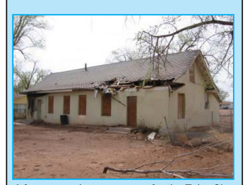
A former employee quarters for the Tuba City Boarding School was recently boarded up.

Similar implementation of risk assessment is underway across the Department of the Interior with the intent of providing Department managers with more accurate health and safety risk ranking information in order to make better decisions concerning hazard occurrences. Using risk assessment also provides decision-makers with a consistent and defensible approach to prioritizing health and safety abatement efforts which compete for resources with other program priorities.