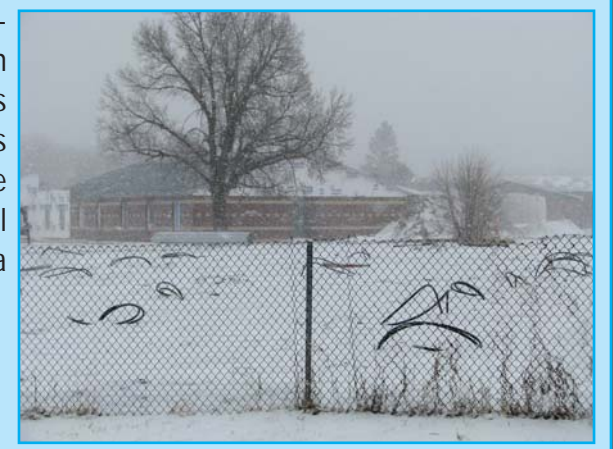
Tubes linking the ground source heat pump wells next to the new Pine Ridge School dormitory in South Dakota emerge through a spring 2009 snow.