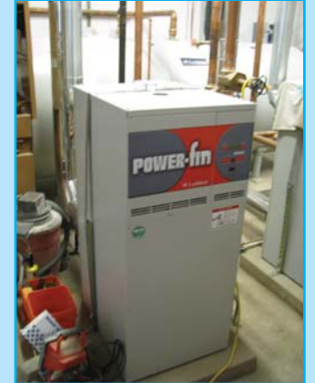
The heating units for inside air and for hot water are high efficiency and are connected to a computer-based building management system which will ensure their operation is reduced during off-peak hours.