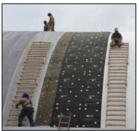
ARRA funds are being use to re-roof the gymnasium at Mississippi Choctaw Central Schools.