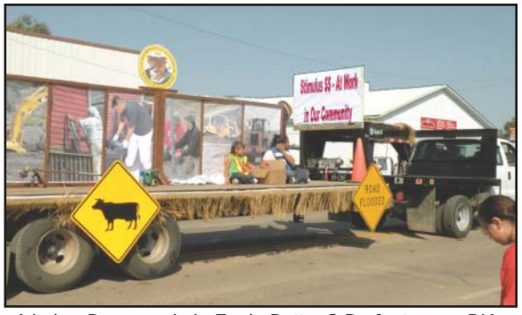
A Labor Day parade in Eagle Butte, S.D., features a BIA Agency float celebrating the Recovery Act.

The large number of OFMC projects funded by the American Recovery and Reinvestment Act of 2009 (ARRA), has prompted the hiring of five project managers—three at OFMC in Albuquerque and one each at Great Plains and Navajo regional offices. OFMC has also hired a coordinator for National Environmental Policy Act (NEPA) compliance.