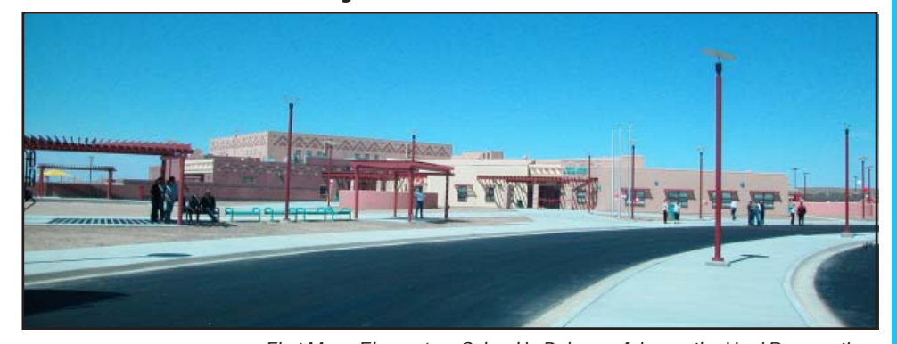
First Mesa Elementary School in Polacca, Ariz., on the Hopi Reservation.

First Mesa Elementary School has achieved LEED certification and becomes the second Bureau of Indian Affairs school in the nation, and the first school in Arizona, to be recognized with this national award for sustainability. The 74,000-square-foot project, located on the Hopi Indian Reservation, serves 400 K-6 students. First Mesa features include daylighting, healthy building materials, a non-toxic building maintenance program and superior indoor air quality. Recycling infrastructure was designed into the building to reduce waste and to teach students about responsible material use. The school uses nearly 35% less water through the use of efficient fixtures and saves even more by using native, no-water-use plants. The Leadership in Energy & Environmental Design (LEED) Rating System has been adopted by the Department of the Interior as a standard for developing high performance, sustainable buildings.