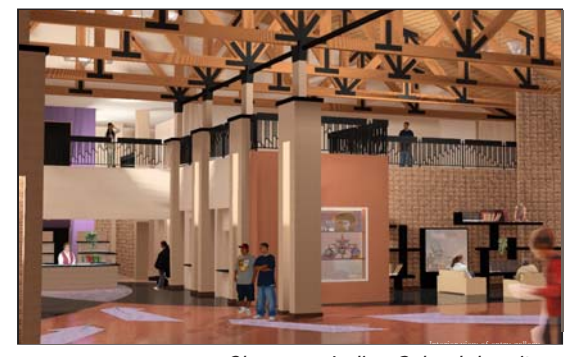
Chemawa Indian School dormitory.

The dorm will have a student bank, recreation center, mail facilities and counseling services, all of which are currently separated from the 10 cottages that house 40 students each. The cottages will be demolished.