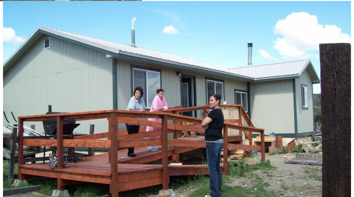
Blackfeet – Renovation (after)