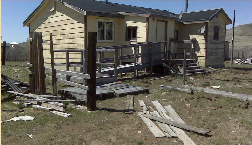
Blackfeet – Renovation (before)