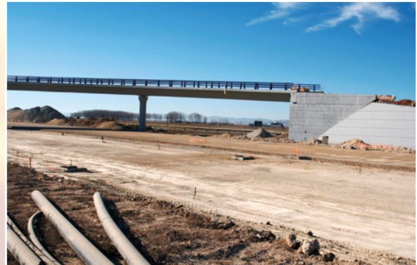
BRIDGES AND INFRASTRUCTURE

The Division of Energy and Mineral Development is the only government agency with the unique ability and mandate to assist Tribes in 1) locating and evaluating construction aggregate resources, 2) identifying and assisting with required permitting requirements, and 3) drafting portions of technical requirements (such as mine and reclamation plans) for aggregate development, and 4) locating potential business partners (as needed).