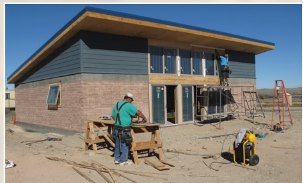
HOME BUILDING IN PROGRESS