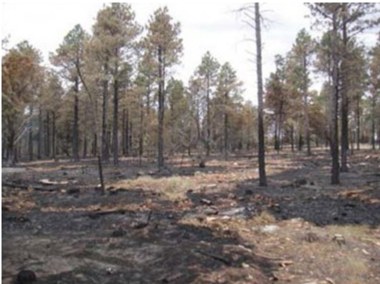
Low intensity fire experienced in Fuelbreak.

Thinning, logging, piling, chipping and mechanized shredding treatments to an area approximately 130 feet wide and 5.9 miles long (total area of 85 acres) in 2004 and 2005 (with some follow-up fuels treatments in 2012) along the southern and eastern boundary of the Southern Pueblos Agency created the Isleta East Boundary Fuel break. At a cost of $106,000, this work modified the fuel bed, creating open-canopy forest conditions limiting the understory and light surface fuel loading.